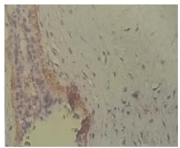
Figure 1: First miscarriage chorionic villi with positive expression of \beta -catenin (brownish cytoplasm)